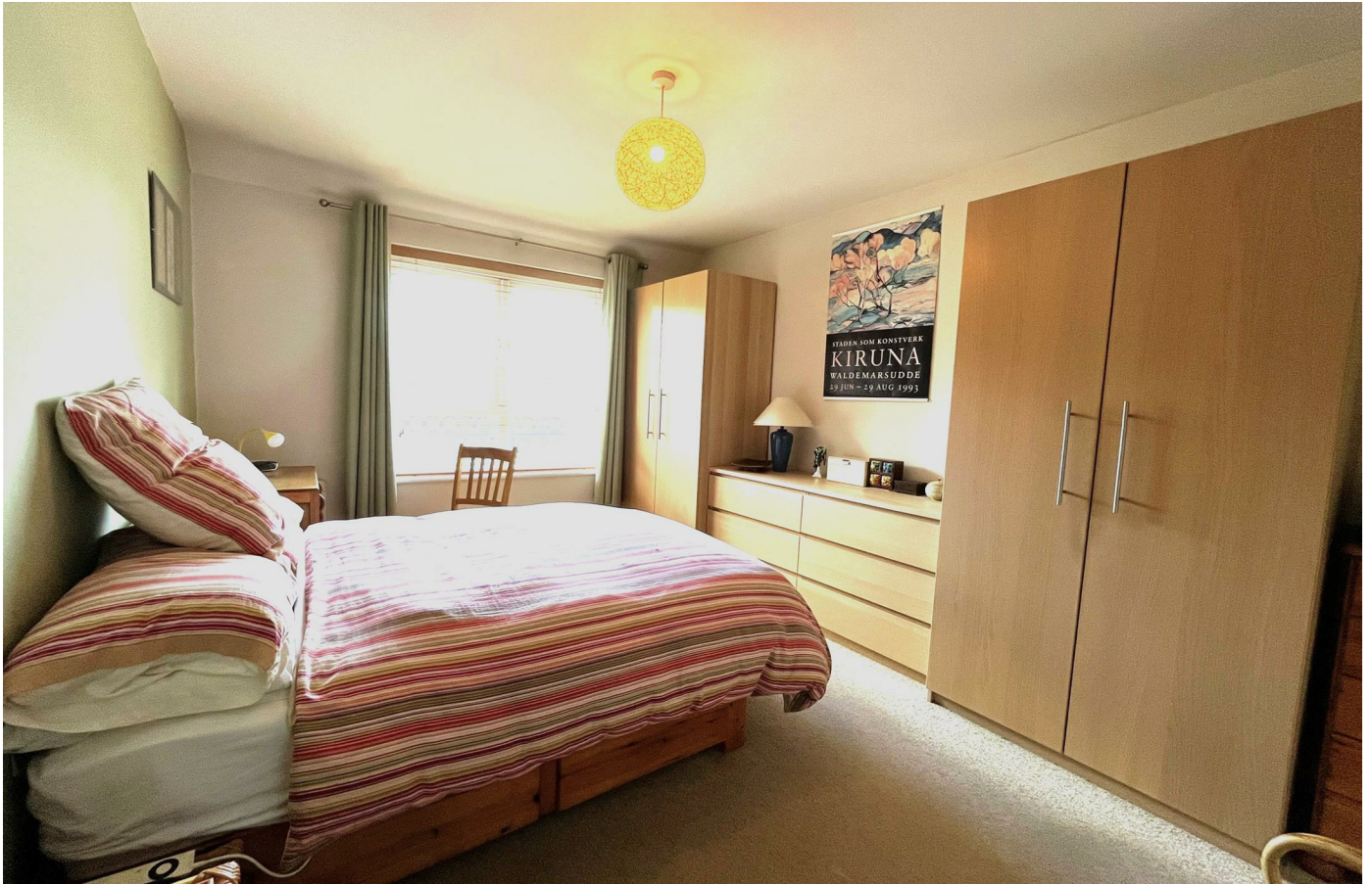
31 Bread And Meat Close, Warwick, CV34 6HF